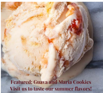
Featured: Guava and Maria Cookies Visit us to taste our summer flavors!