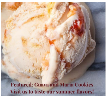
Featured: Guava and Maria Cookies Visit us to taste our summer flavors!