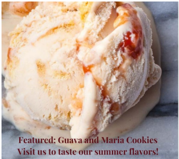
Featured: Guava and Maria Cookies Visit us to taste our summer flavors!