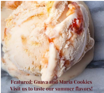
Featured: Guava and Maria Cookies Visit us to taste our summer flavors!