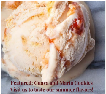
Featured: Guava and Maria Cookies Visit us to taste our summer flavors!