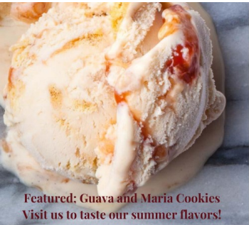
Featured: Guava and Maria Cookies Visit us to taste our summer flavors!