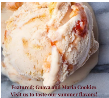
Featured: Guava and Maria Cookies Visit us to taste our summer flavors!