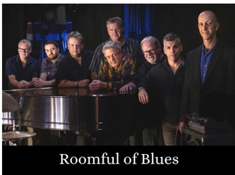
Roomful of Blues

8 p.m. Friday, June 24 at Vinegar Hill. Tickets are $30-35.