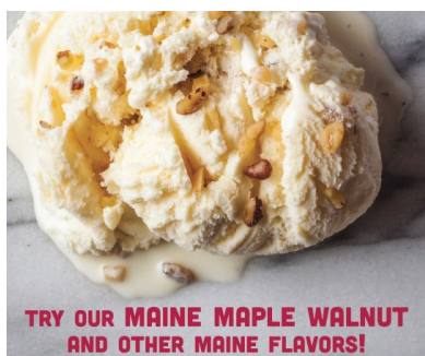
TRY OUR MAINE MAPLE WALNUT AND OTHER MAINE FLAVORS!

G) H.B. Provisions: 15 Western Ave. Soups, sandwiches, breakfast, grocer-